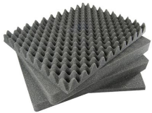
1651 4 pc. Replacement Foam Set