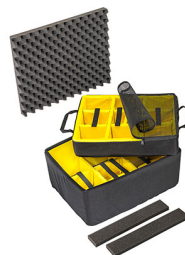
1607AirDS Padded Divider Set