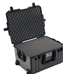
1607WF With Foam