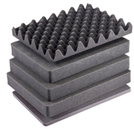
1507AirFS 5 pc. Replacement Foam Set