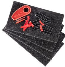
1506TPKIT TrekPak Case Divider Kit