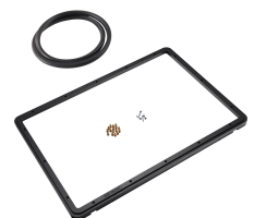
1520PF Special Application Panel Frame