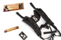
RucPac-normal RucPac Standard Hardcase Backpack Conversion