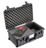
1535AIRTPF TrekPak / Foam Hybrid