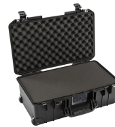
1535WF With Foam