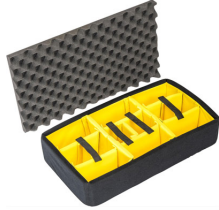
1555AirDS Padded Divider Set