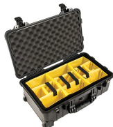
1514 With Padded Dividers