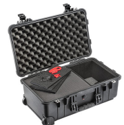
1510TPF TrekPak / Foam Hybrid