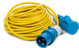
9606E Power Cable

Peli c/ Provença, 388, Planta 7 • Barcelona, Spain 08025 • Phone: +34 934 674 999 info@peli.com • www.peli.com