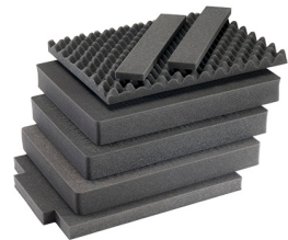
1607AirFS 7 pc. Replacement Foam Set

c/ Provença, 388, Planta 7 • Barcelona, Spain 08025 • Phone: +34 934 674 999 info@peli.com • www.peli.com