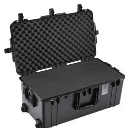
1626WF With Foam