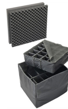
0375 Padded Divider Set