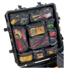
0379 Lid Organizer