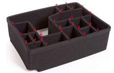
1560EUTP TrekPak Case Divider Kit