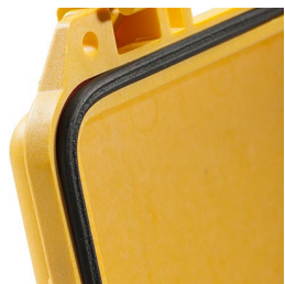
1783 Replacement O-ring