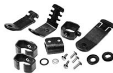
0770 Helmhalter für Lampenmontage