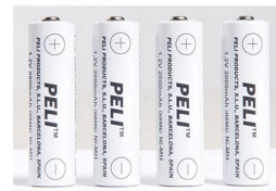
2469P Replacement Battery