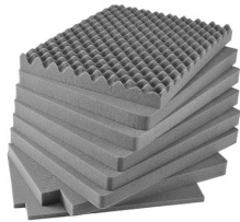
iM2750-FOAM 8 pc. Replacement Foam Set