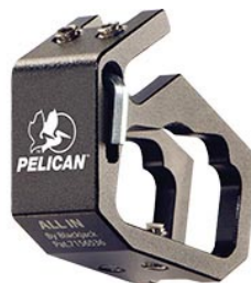
0782 Helmet Light Holder