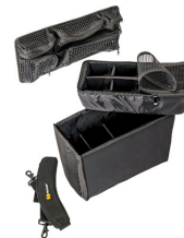
1435 Padded Divider Set