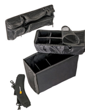
1435 Padded Divider Set