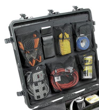
1699 Lid Organizer