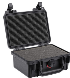
1120WF With Foam