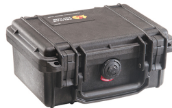
1120NF No Foam