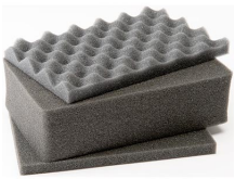
1121 3 pc. Replacement Foam Set