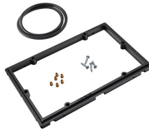
1120PF Special Application Panel Frame