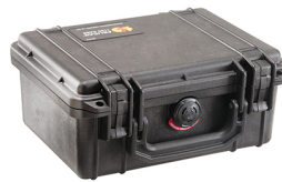
1150NF No Foam