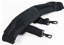
iM2370-STRAP-S Removal Padded Shoulder Strap