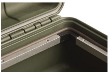
iM2600-MBEZ-B Base Bezel (Metric)