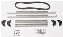
iM27XX-M4-BEZEL-L Lid Bezel (Metric)