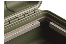
iM27XX-M4-BEZEL Base Bezel (Metric)