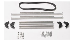
iM27XX-M4-BEZEL-L Lid Bezel (Metric)