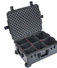
iM2720-X0006 With TrekPak Divider System