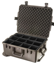
iM2720-X0002 With Padded Dividers