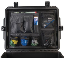
iM27XX-UTILITYORG Utility Organizer