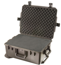
iM2720-X0001 With Foam