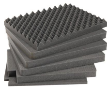
iM2720-FOAM 5 pc. Replacement Foam Set