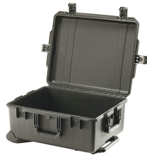
iM2720-X0000 No Foam