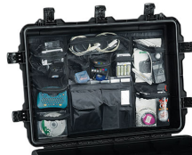
iM3075-UTILITYORG Utility Organizer