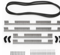
iM3075-M4-BEZEL-L Lid Bezel (Metric)