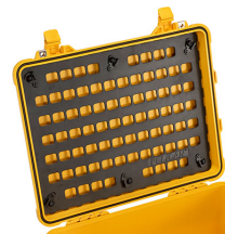
1560MP EZ-Click™ MOLLE Panel