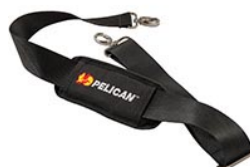
9487 Padded Shoulder Strap