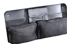
1449 Office Lid Organizer