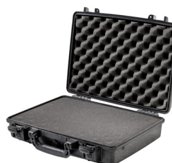
1470WF With Foam