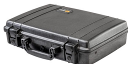
1470NF No Foam