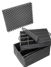
1645 Padded Divider Set