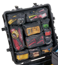
0379 Lid Organizer