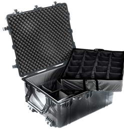
1694 With Padded Dividers