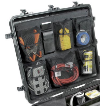
1699 Lid Organizer