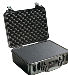
1520WF With Foam