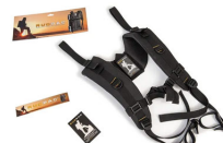
RucPac-normal RucPac Standard Hardcase Backpack Conversion