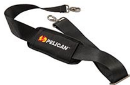
9487 Padded Shoulder Strap