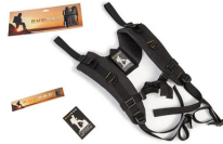
RucPac-normal RucPac Standard Hardcase Backpack Conversion