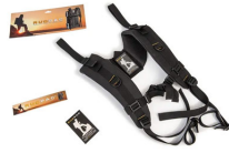
RucPac-normal RucPac Standard Hardcase Backpack Conversion

c/ Provença, 388, Planta 7 • Barcelona, Spain 08025 • Phone: +34 934 674 999 info@peli.com • www.peli.com