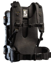
RucPac-Pro-1 RucPac Pro Hardcase Backpack Conversion