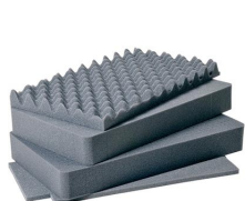
1511 4 pc. Replacement Foam Set

Wheels 2 Extendable Handle yes Master Pack 2 Nameplate yes Reduced Area yes Military yes