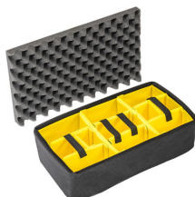
1515 Padded Divider Set