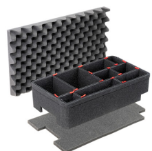
1510TPKIT TrekPak Case Divider Kit