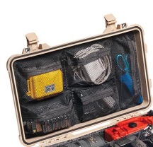
1519 Lid Organizer