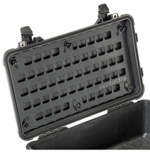
1510MP EZ-Click™ MOLLE Panel