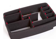
1510EUTP TrekPak Case Divider Kit