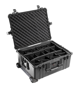
1614 With Padded Dividers