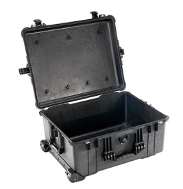
1610NF No Foam