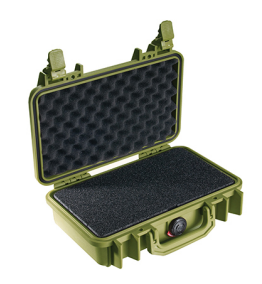
1170WF With Foam