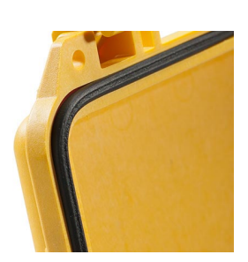
1783 Replacement O-ring