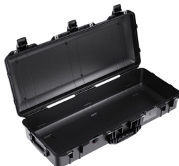
1705NF No Foam