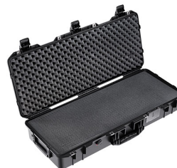
1705WF With Foam