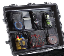
1639 Lid Organizer