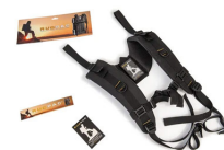
RucPac-normal RucPac Standard Hardcase Backpack Conversion