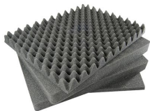
1651 4 pc. Replacement Foam Set