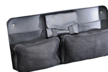
1449 Office Lid Organizer