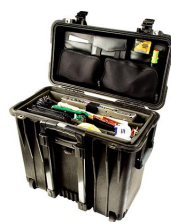
1446 Office Divider Set & Lid Organizer