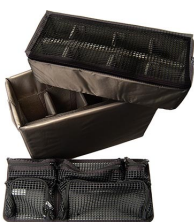
1445 Utility Padded Divider Set & Lid Organizer