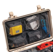
1519 Lid Organizer