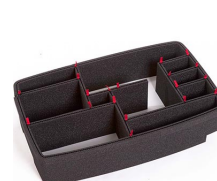
1510EUTP TrekPak Case Divider Kit