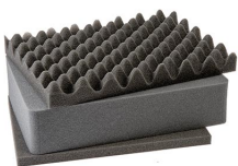
1451 3 pc. Replacement Foam Set

Master Pack 4 Nameplate yes Military yes