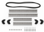
iM2200-MBEZ-B Base Bezel Kit (Metric)