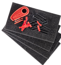
1506TPKIT TrekPak Case Divider Kit